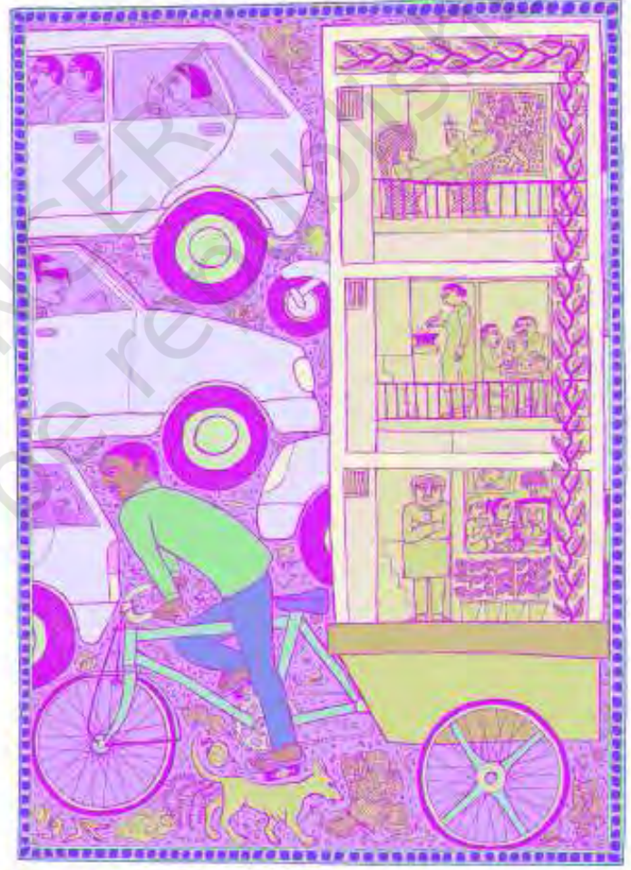
"Without me they cannot develop... in this system I cannot develop!"

The idea of development or progress has always been with us. We have aspirations or desires about what we would like to do and how we would like to live. Similarly, we have ideas about what a country should be like. What are the essential things that we require? Can life be better for all? How should people live together? Can there be more equality? Development involves thinking about these questions and about the ways in which we can work towards achieving these goals. This is a complex task and in this chapter we shall make a beginning at understanding development. You will learn more about these issues in greater depth in higher classes. Also, you will find answers to many of these questions not just in economics but also in your course in history and political science. This is because the way we live today is influenced by the past. We can't desire for change without being aware of this. In the same way, it is only through a democratic political process that these hopes and possibilities can be achieved in real life.